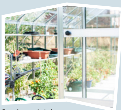
Greenhouse photo by Ceri Wood Photography